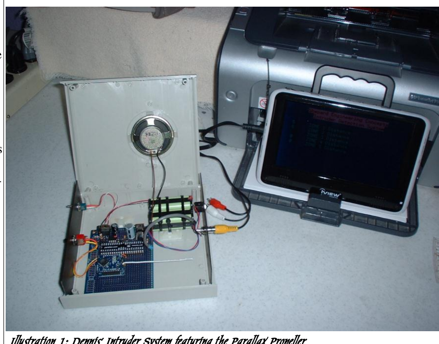
Illustration 1: Dennis' Intruder System featuring the Parallax Propeller

A series of six articles were published in Nuts & Volts magazine between 2000-2002, utilizing Microchip devices programmed in Parallax assembly language. Recently, with the advent of the Propeller & the need for parallel processing applications, I began investigating what software was available that would expedite development & provide enhanced debugging options.